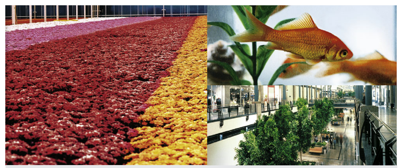
OSRAM FLUORA® lamps are the light sources for plants and aquariums. They emit most of their light at the blue and red ends of the spectrum. Their spectrum is perfectly matched to that required for photo-biological processes. The result is healthier plants. Plants really thrive under FLUORA® light even in rooms where there is little or no natural daylight.

The light from OSRAM FLUORA® fluorescent lamps is particularly strong at the blue and red ends of the spectrum and thus is ideal for promoting photo-biological processes in plants. The result is healthier plants. OSRAM FLUORA® lamps are used wherever plants do not receive enough natural daylight, for example over feature planting in shopping centres, offices, hotels and the home, and also for florists' shops, greenhouses and aquariums.